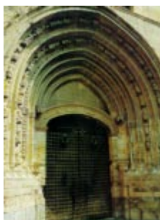
Cathedral of the Salvador and Santa Maria