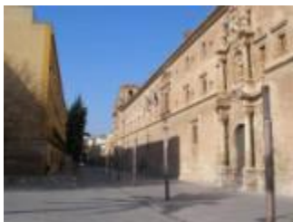
Convent of Santo Domingo